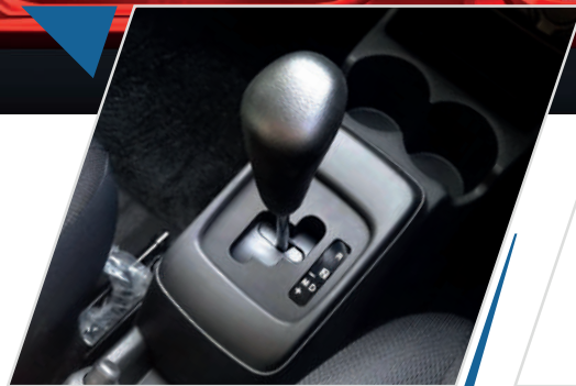
AUTO GEAR SHIFT TECHNOLOGY