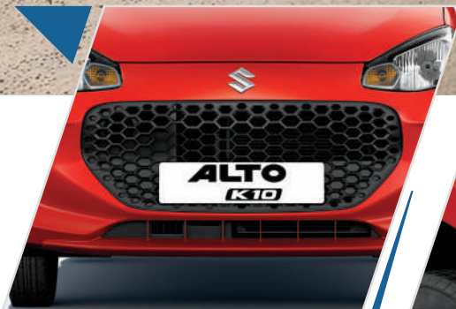
YOUTHFUL CONTEMPORARY DESIGN WITH HONEYCOMB GRILLE

Now experience the feeling of accomplishment with a special companion, the Alto K10. It offers remarkable looks with a great combo of style and modernity.