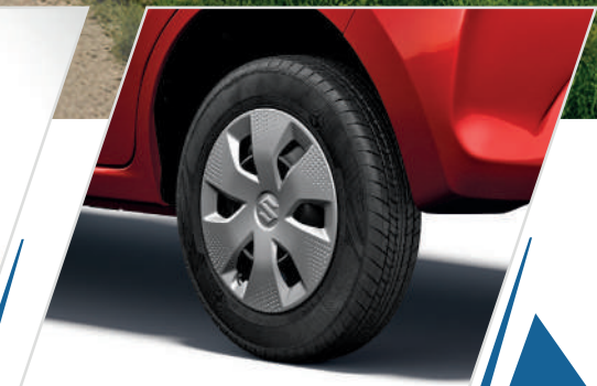
145/80 R13 TYRES WITH HONEYCOMB WHEEL COVERS