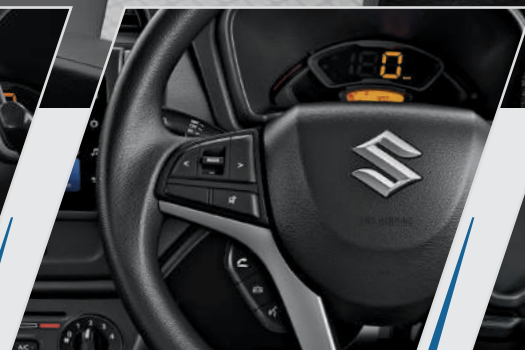
STEERING MOUNTED AUDIO AND VOICE CONTROL