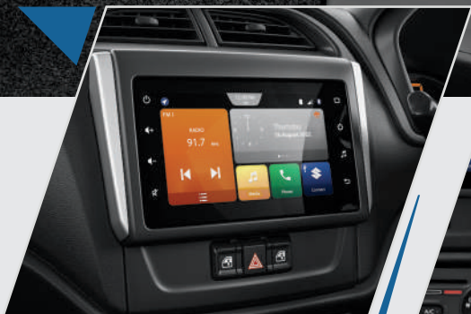
SMARTPLAY STUDIO WITH SMARTPHONE NAVIGATION

Alto K10 comes with modern interiors with updated technology, a perfect blend of comfort and practicality.