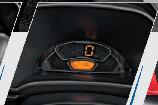
SPEEDOMETER WITH EXCITING DIGITAL SPEED DISPLAY