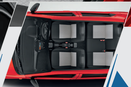
1 st IN SEGMENT 4 SPEAKERS