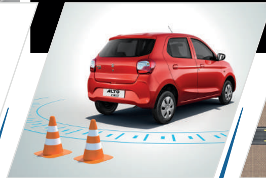
REVERSE PARKING SENSORS