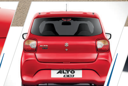
TRENDY REAR COMBINATION LAMPS